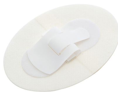
Optional Securement Device (sold separately)